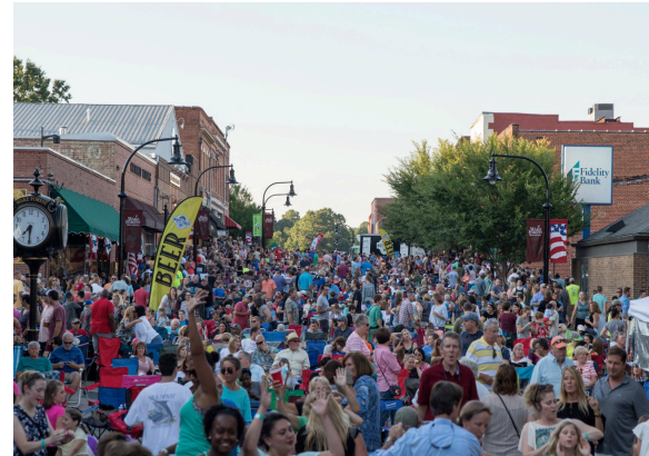
Friday Night on White Event, Downtown Wake Forest, August 2017