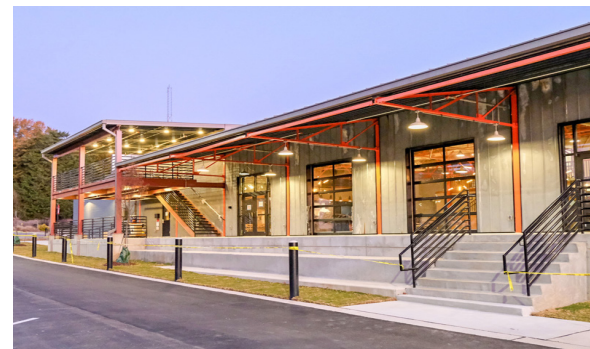
Loading Dock, Wake Forest