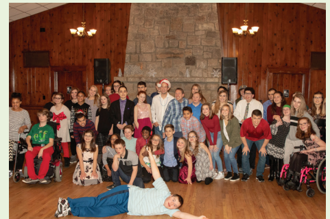
Inside Wake Forest Community House