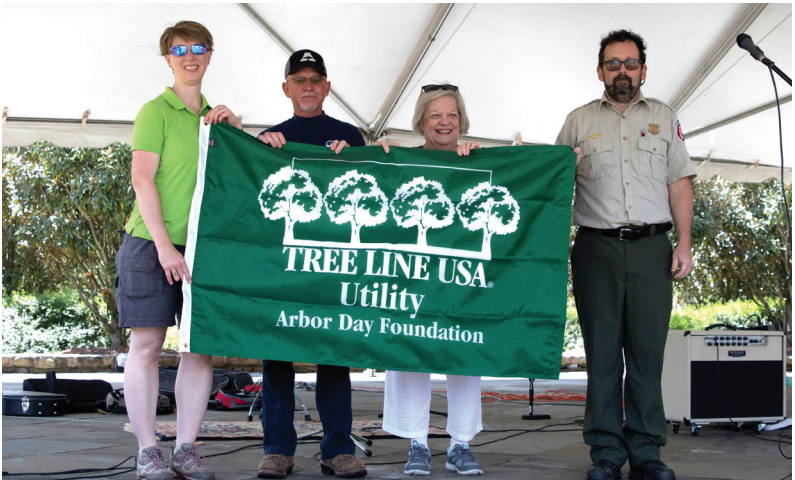
Wake Forest Power has been named a “Tree Line USA” utility by the Arbor Day Foundation. The award is presented during the Town’s annual Arbor Day Celebration.

Wake Forest Power conducts an extensive year-round line-clearing program safely trimming trees and clearing brush from more than 70 miles of distribution lines and keeping the bases of nearly 1,400 distribution poles free of vegetation. Tree trimming is an integral part of complying with state and federal laws and providing increased service reliability to customers.