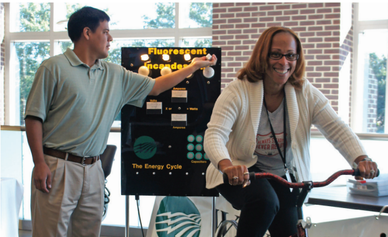
Learn about power through interactive displays during Public Power Week.

Wake Forest Power has earned the RP3 designation continuously since 2007. The designation is active for three years, after which time a utility must reapply.