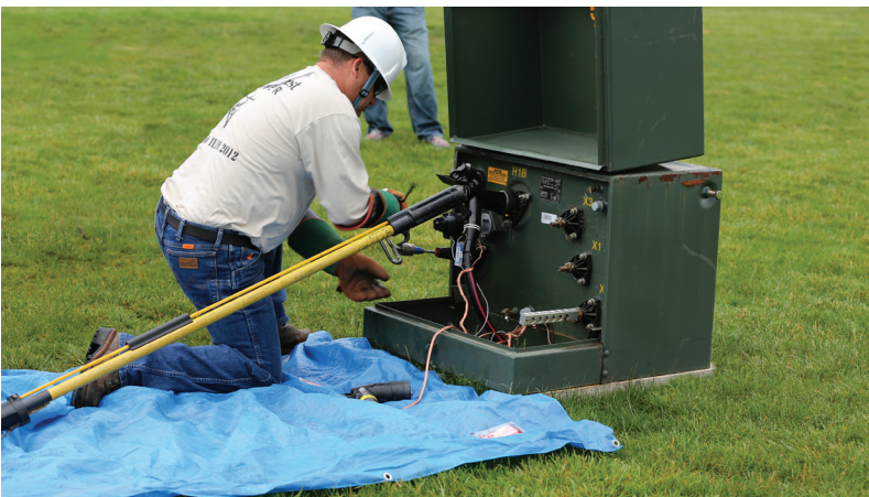
Crews need access to the front of pad mount transformers. Please keep 10 feet of space in front of the transformer clear of shrubs and plantings.

Be mindful of power lines when planting trees. For underground power lines, trees should be planted far enough away from the pad mount equipment that when they reach maturity, overhanging branches won't obstruct a crane from removing a defective transformer or setting a new one. Trees, shrubs and other landscape plantings should not be placed on the utility easement above underground electric cable. Do not change the grade around equipment to avoid problems with access and