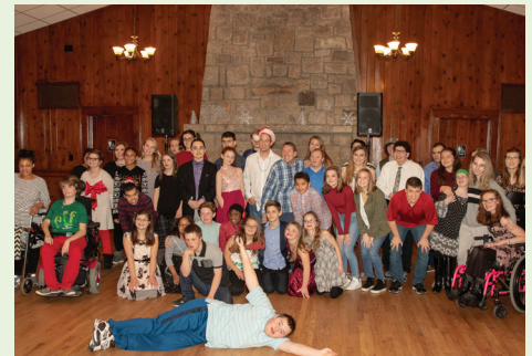
Inside Wake Forest Community House