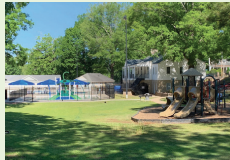
Holding Park Pool (adjoining facility – not rented)