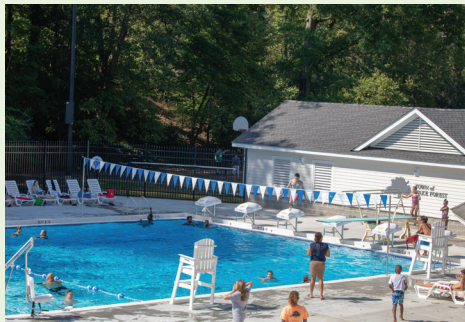
Holding Park Pool (adjoining facility – not rented)