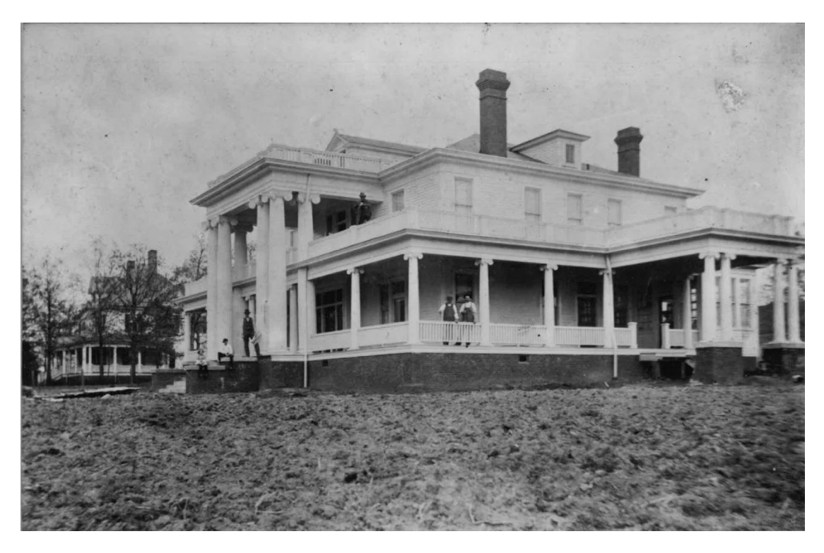
Photo 5: Documentary photo taken shortly after construction in 1912.