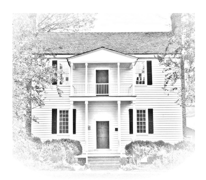
The circa 1820 Calvin Jones House