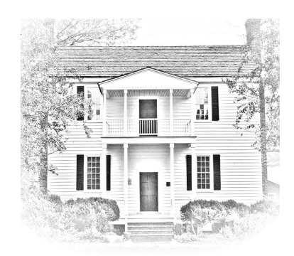
The circa 1820 Calvin Jones House