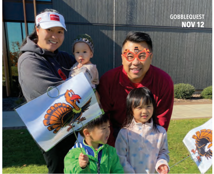
GOBBLEQUEST NOV 12