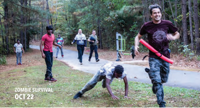
ZOMBIE SURVIVAL OCT 22