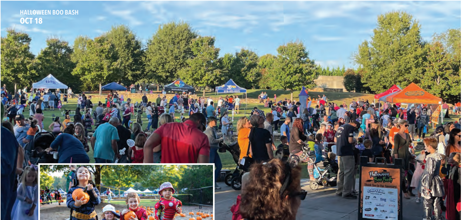
HALLOWEEN BOO BASH OCT 18